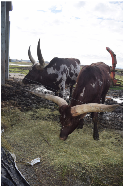
Tahonta and Dakota