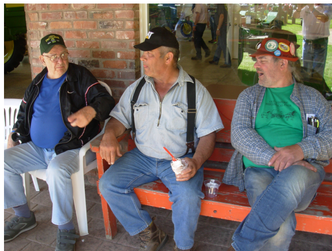
August 2011 PSAT&MA Can you name these people?