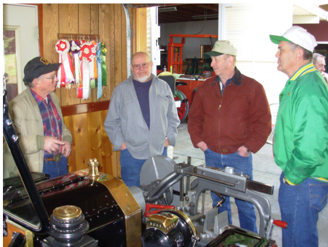
April 6, 2009 Shop Tour Can you name these people?