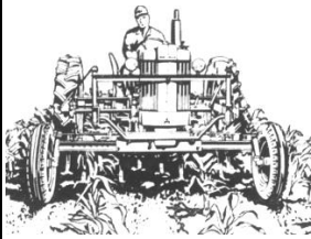
John Deere 40