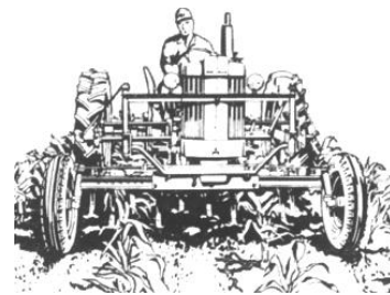
John Deere 40